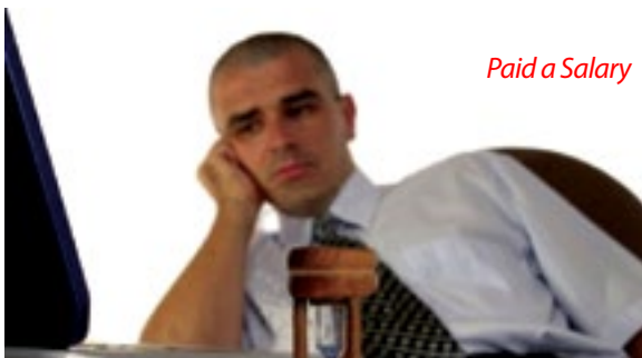
ABC Loan Company

"I don't have time to continually follow up with each and every lead! I'm busy!"